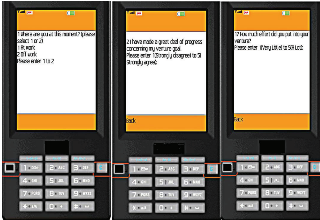
Figure 2 Experience Sampling Methodology via Cell Phones: Sample Screenshots

time periods to prompt them to respond without being too disruptive. For example, in examining the affective influences on venture efforts, an ESM schedule between 10 a.m. to 10 p.m. can be adopted because we want to survey entrepreneurs during their typical work hours. An ESM schedule that includes extremely late hours would be too intrusive even though entrepreneurs might work erratic hours.